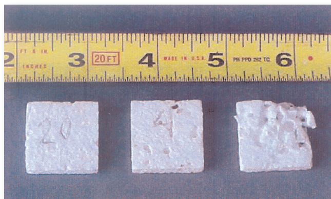
Photo A: Comparison of EPS in AWPA E1 two choice test (4 week exposure) (L-R): PREVENTOL® TM Preservative Insecticide, borate, and untreated.

carcinogenicity for humans. The product is safe to handle by insulation installers. Additionally, PREVENTOL® TM Preservative Insecticide has low water solubility which ensures the active ingredient will remain in the foam, thus providing long term efficacy against termites, even under harsh conditions and climates.